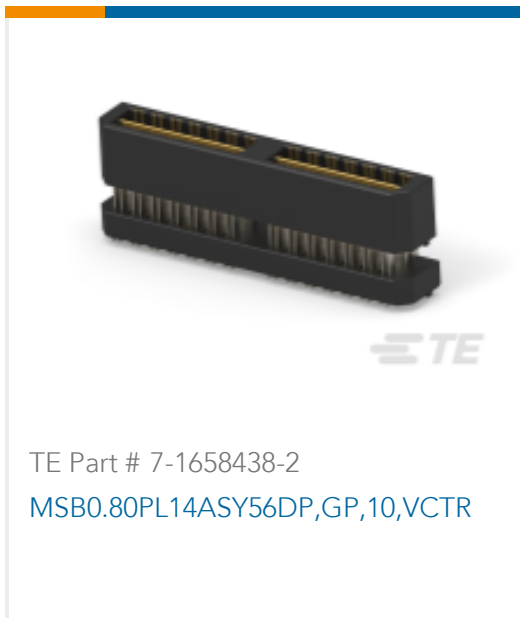
TE Part # 7-1658438-2 MSB0.80PL14ASY56DP,GP,10,VCTR