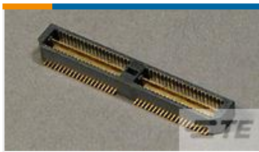
TE Part # 7-1658013-2 MSB0.80PL5ASY56DP,GP,10,VCTR