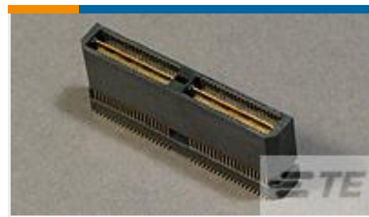
TE Part # 7-1658016-2 MSB0.80PL16ASY56DP,GP,10,VCTR