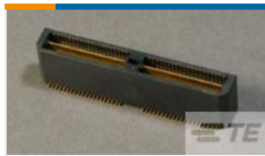
TE Part # 7-1658015-2 MSB0.80PL11ASY56DP,GP,10,VCTR